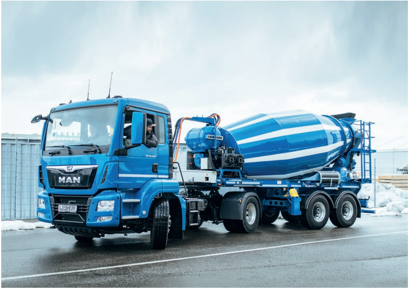
ETM 1004 T